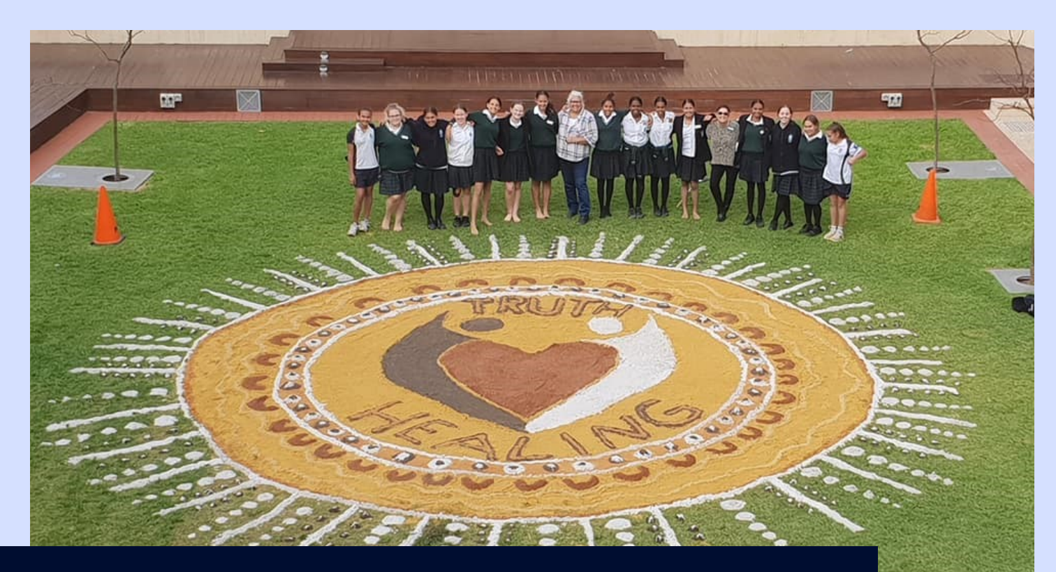
Presbyterian Ladies' College Reconciliation Week