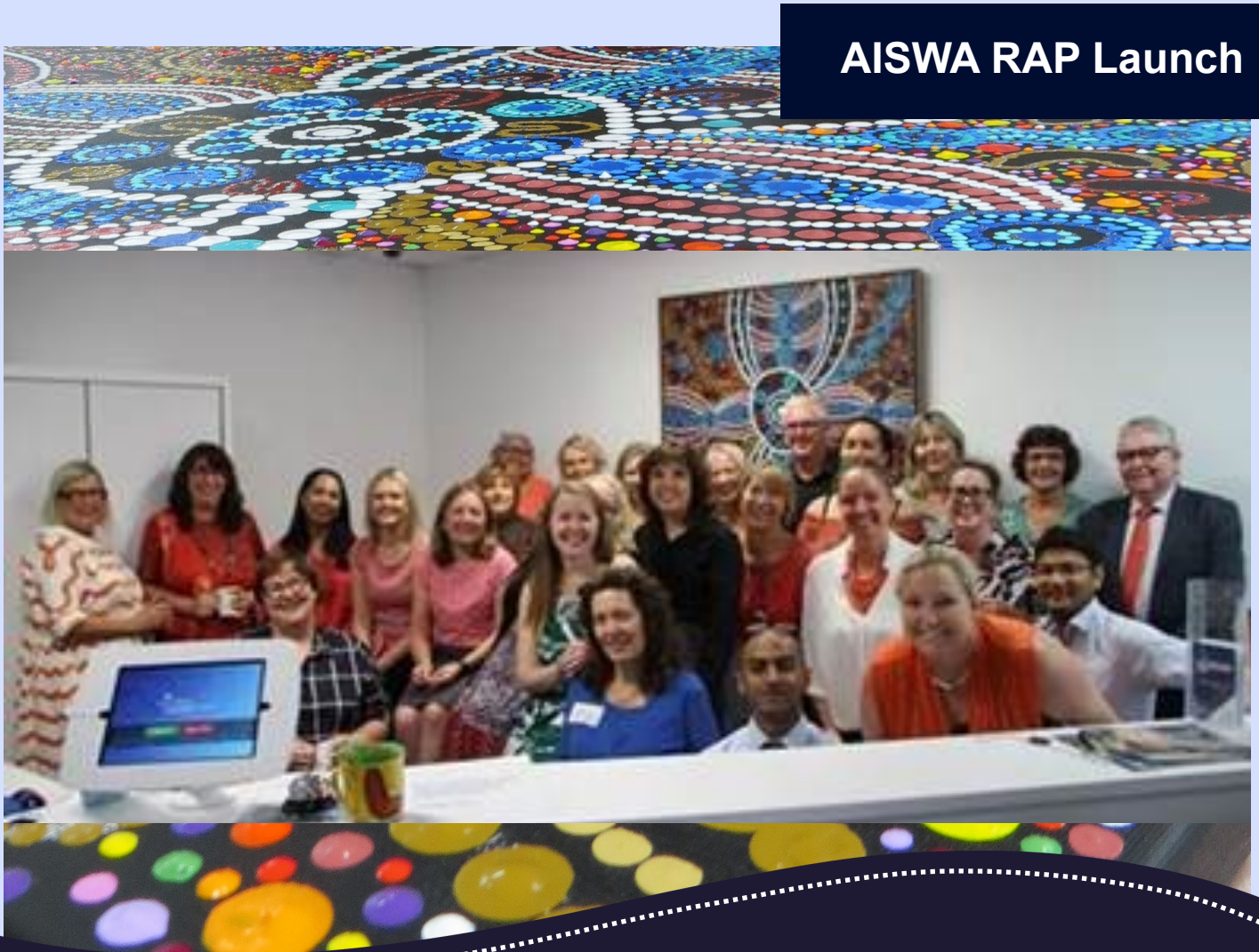
AISWA RAP Launch

Pictured below are some of the AISWA staff at the RAP Launch