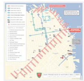
Click map to view services and attractions

More information is available at: http://www.streetcar.org/