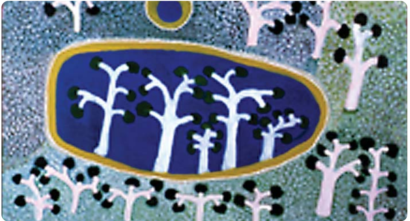
Artists, Details to go in here