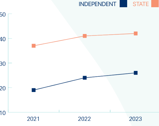
PERCENTAGE (%) OF STUDENTS WHO UNDERTOOK A GENERAL PATHWAY*

(Please note this data does not exist for 2019-2020)